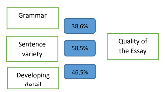
Figure 2. Contribution of corrections on quality of the essay

To see level of contribution of each technique on the quality of the essay, results of Beta test was used. See Figure 2.